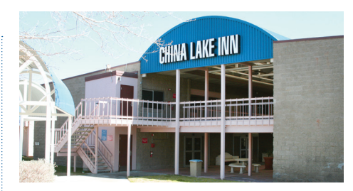
RATES PER MONTH

NAWS China Lake Golf Course, open to all with base access, is a pinnacle for golfers in the High Desert. (Patronage: 3,500/mo.)