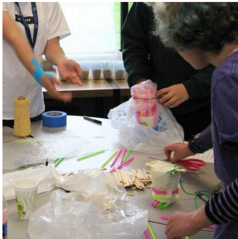
TEENS CREATING THEIR EGG PARACHUTE SHUTTLES