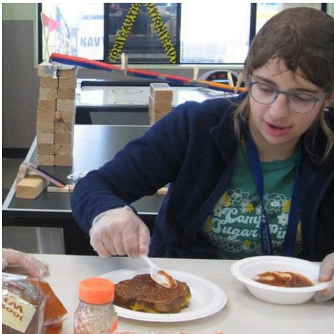
LEARNING THE ART OF THE PERFECT GRILLED CHEESE SANDWICH

OPERATION EGG DROP!!! TEENS DESIGNED "EGG PARACHUTES" & DROPPED THEM FROM THE ROOF OF THE TECH. THE GOAL WAS TO DESIGN AN EGG COCKPIT THAT WOULD PREVENT THE EGG FROM CRACKING FROM IMPACT. THE SURVIVAL RATE OF OUR EGGS WAS ALMOST 80%!