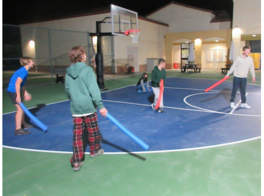
First Teen Night of the Year- Teens joining us on our first Teen Night of the New Year and having fun playing some fun activities.

This Month will be quick! The big thing to look out for is our teen night at the trampoline park Skyzone on the 21st of the Month! We hope to see you there! In addition, there will be the Art Exhibit reception, celebrating the artist of this year's BCCA art exhibit contest!