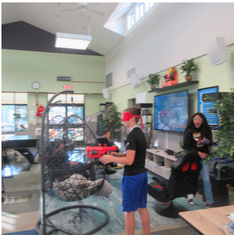
Quiet Game- Teens trying to be quiet and not get hit by a nerf bullet.