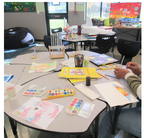
Watercolor- Teens using their own creative minds to create their own art.